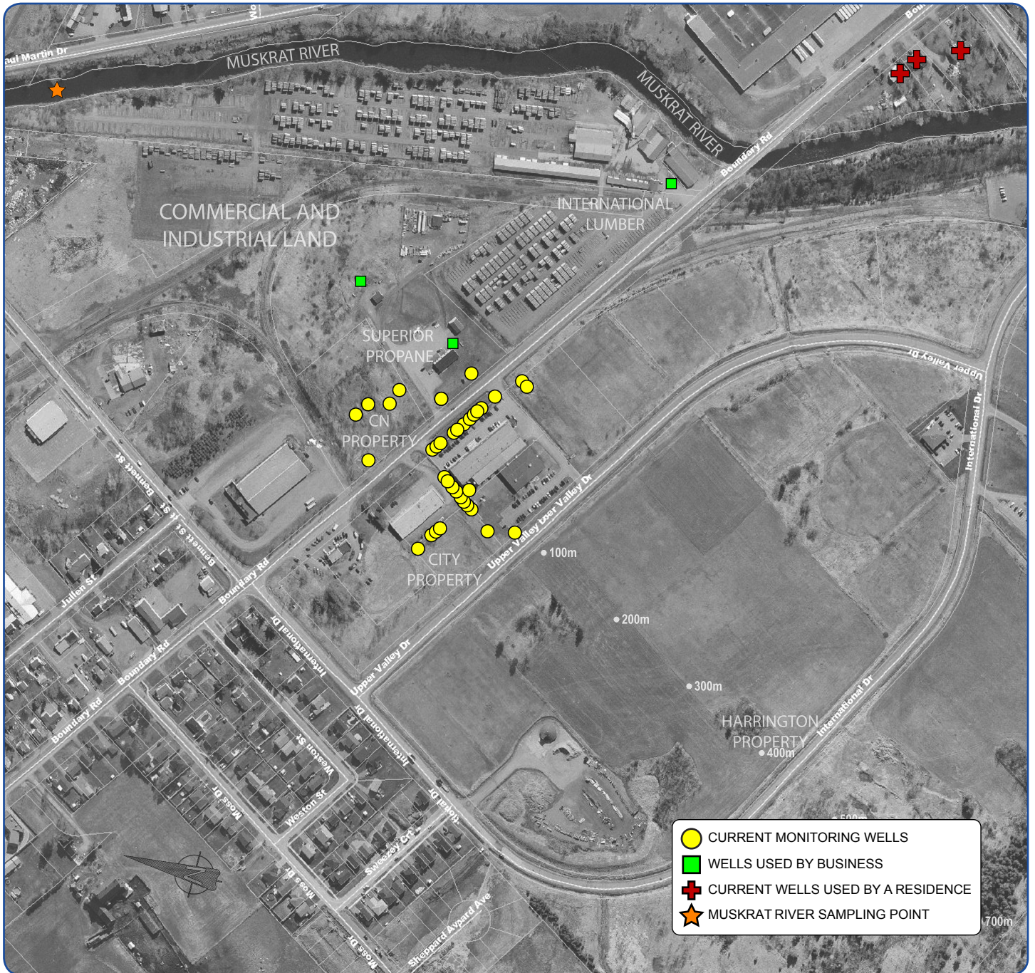
Figure 2: Wells in the vicinity of SRB